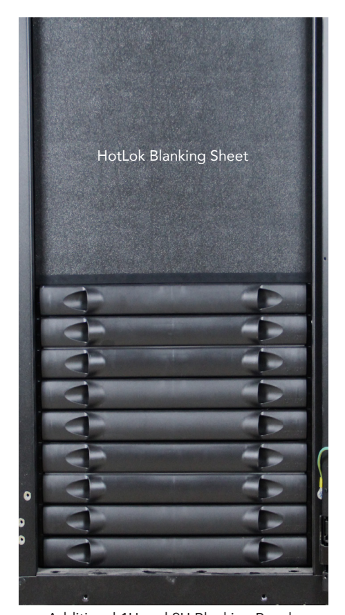
Additional 1U and 2U Blanking Panels for sealing racks up to 50U

Fire Rating: UL 94 HB Fire Resistant Compliance: RoHS Compliant