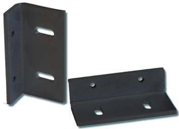
Rack Mounting Ears