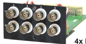
4x E1 BNC I/F