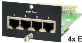
4x E1/T1 RJ45 I/F