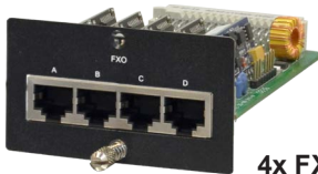
4x FXO I/F