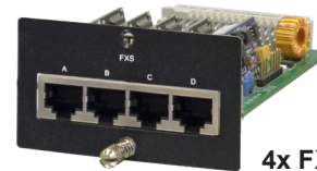
4x FXS I/F