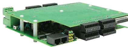
Open circuit board versions are also available.