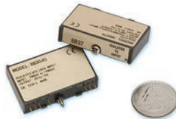
Select from more than 100 8B input modules.